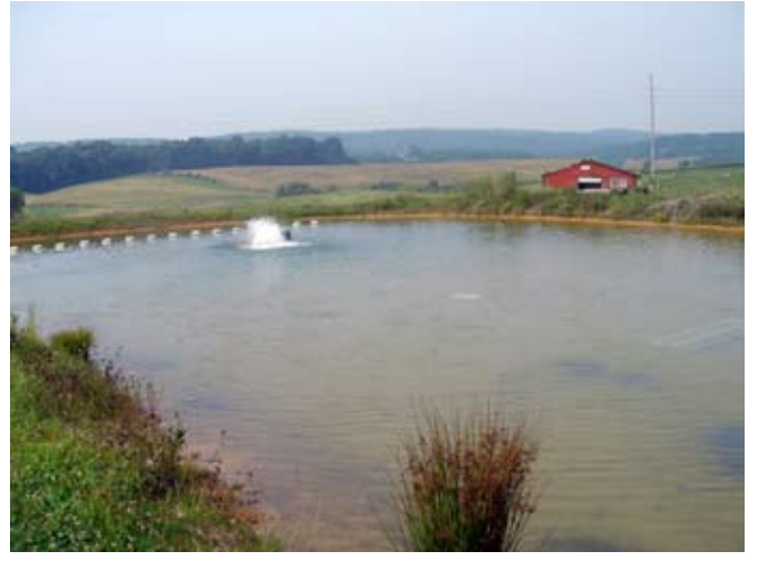
A typical pond at an aquaculture facility receiving oxygenation through a paddle wheel. As energy costs rise, make sure you can accurately determine when to aerate and when it's unnecessary.

Oxygen depletion usually occurs in the summer months because warmer water holds less oxygen than cooler water. For example, water with a temperature of 32°C can hold up to 7.3 mg/L of oxygen, while 7°C water can hold 12.1 mg/L. As water temperatures rise, oxygen levels decrease. Higher temperatures also increase the metabolic rate of fish resulting in the need for more oxygen.